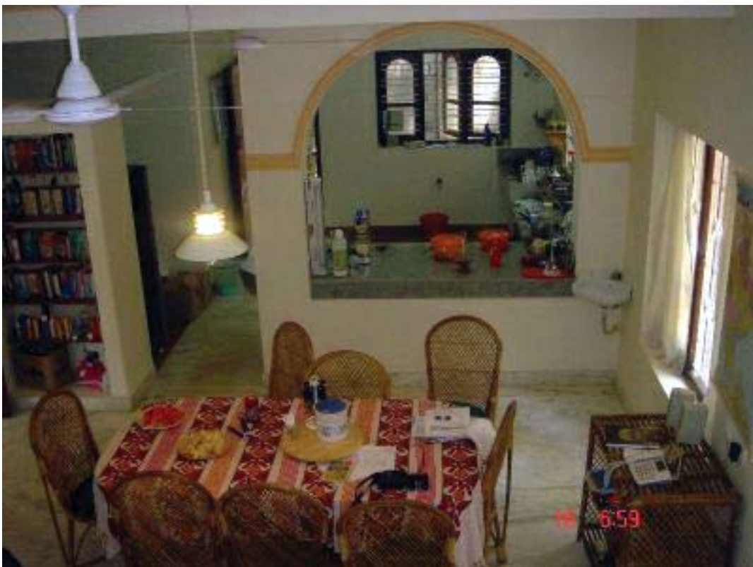
The kitchen and dining room from the staircase