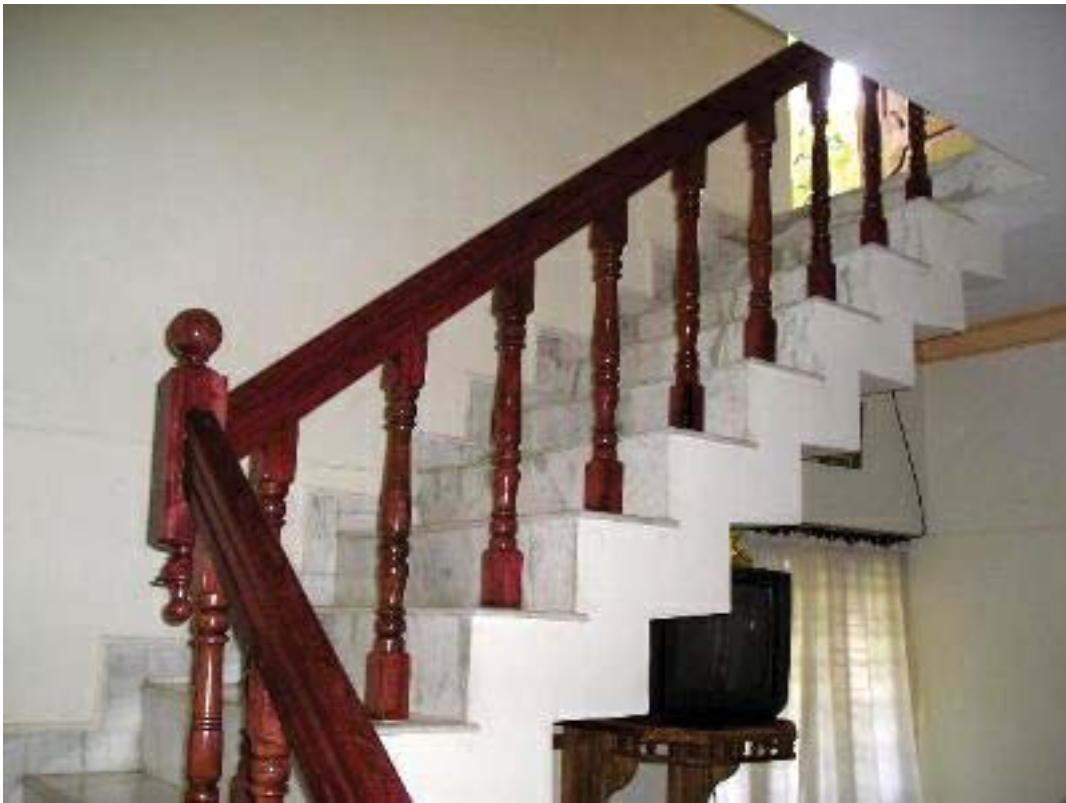
The bannisters with their final polish and varnishing