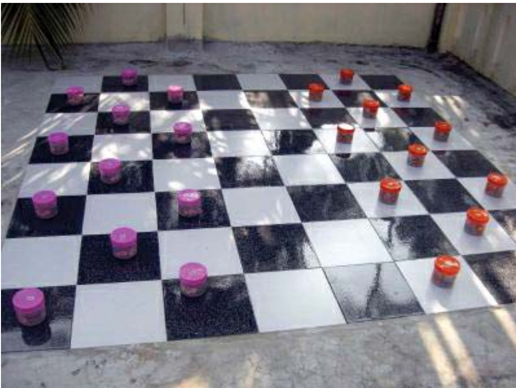
The latest addition to the facilities - a draughts / chess board created with ceramic floor tiles. !!