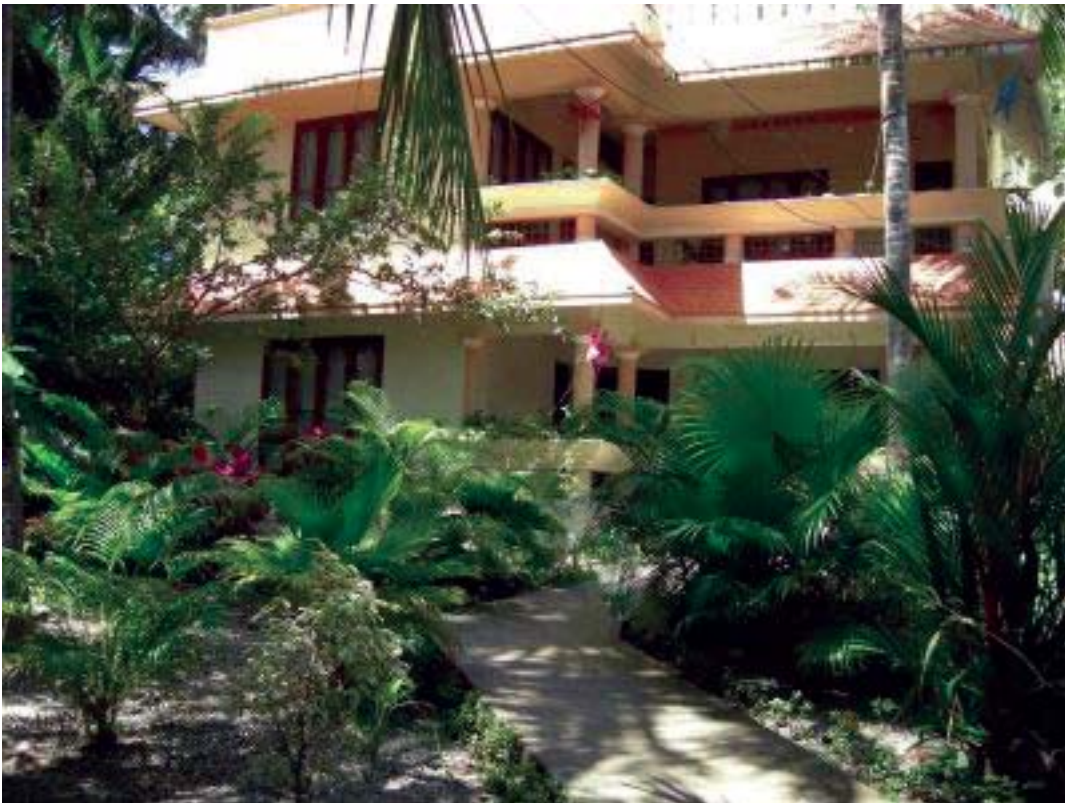
The house with the now blossoming garden - it was just amazing to see the difference after the monsoon rains had helped the growth of the plants